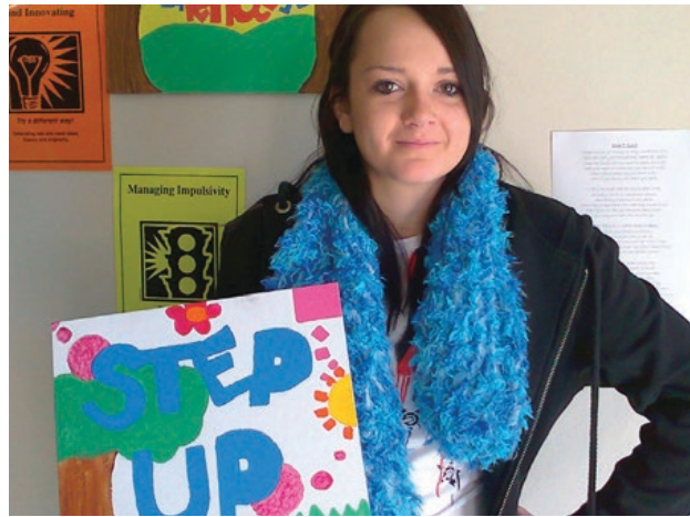
STEP UP PROGRAM HELPING YOUNG PEOPLE

True to its name, the Step Up Program at Youth Off The Streets' Key College, Chapel Campus - Merrylands is an invitation to young people, aged 12 to 18 years, who have become disconnected from mainstream education for a range of reasons to make a successful transition from school to further education, training or employment. Step-Up provides opportunities for students who are ineligible to leave school due to the raised school leaving age. It is also for students who have completed Year 10 and/or older students who need further opportunities to gain a Year 11 Certificate of Attainment, workplace skills and/or TAFE qualifications.