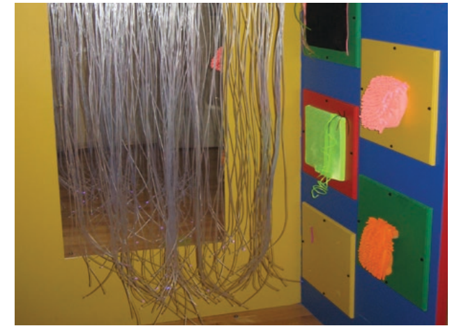
PART OF THE SENSORY ROOM

Participants in FRANS' after school care program fondly refer to it as the 'Disco Room'.