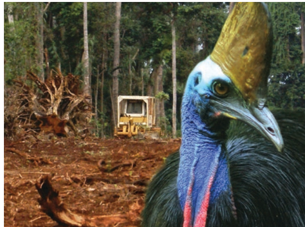
LAND CLEARING ENDANGERING THE SOUTHERN CASSOWARY

The support of the James N. Kirby has contributed to the purchase of two properties under Rainforest Rescue's Daintree Buy Back and Protect Forever Project.