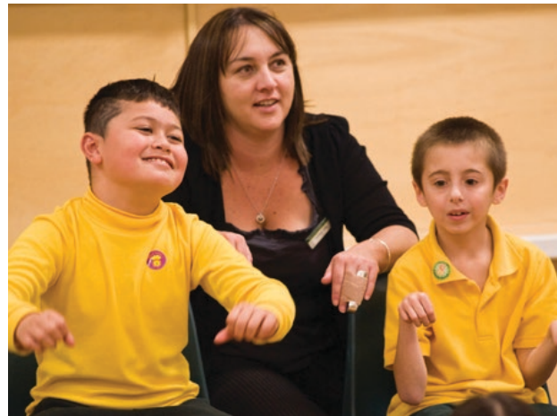
MUSICA VIVA IN SCHOOLS PROGRAM

Musica Viva is the largest provider of music education programs in Australia.