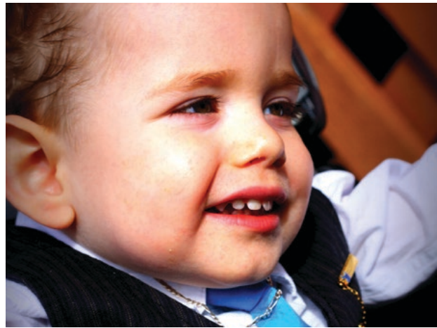
HELPING CHILDREN WITH EPILEPSY LIVE A FULFILLING LIFE

Beginning in 1952 as a local association, Epilepsy Action Australia (EAA) has developed into the largest provider of specialist epilepsy services in the community for people with epilepsy and other seizure disorders, their carers, families and the broader community. EAA is committed to delivering equitable and consistent services to all people in Australia, building services around health education and interventions that facilitate client self-management.